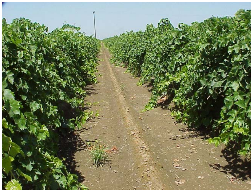
Grapevines growing on the east side of the Central Valley.