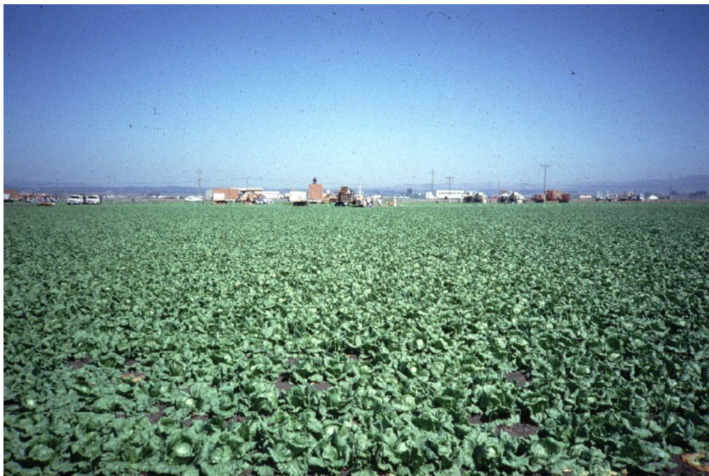
Small vegetables growing in Salinas Valley.