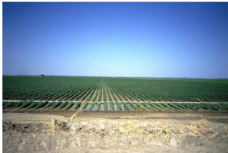
Cotton irrigated in California’s San Joaquin Valley with gated pipe.

The following instructions will show how to obtain appropriate values from the tables presented in this publication for irrigation scheduling and system design.