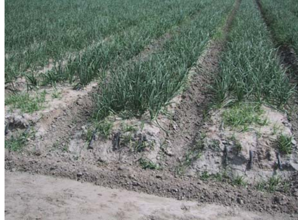
Onions grown with drip in the San Joaquin Valley.

The monthly values of ETc that fall within the crop growing season are shown in bold for each crop in the table.