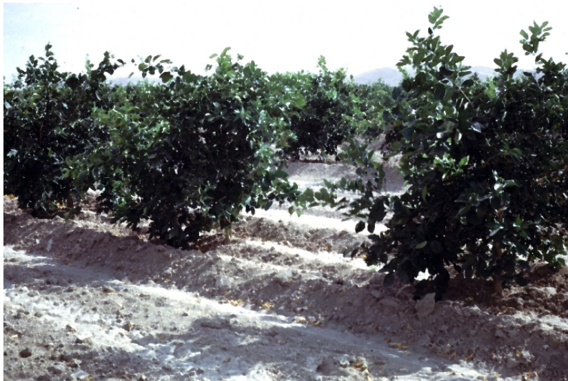
Citrus grows on the south and central coast, the San Joaquin Valley, and in the deserts of southern California.

ETc Tables 40-43 – E and T from Precipitation