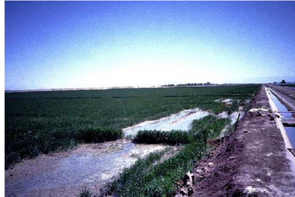
Alfalfa growing in Imperial Valley near El Centro, California.